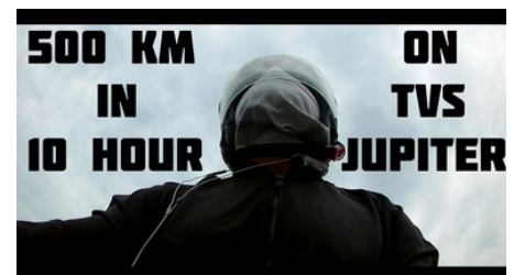
VLOG | Delhi to Ambala | 500 KM in 10 Hours on Scooty