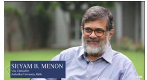
Ambedkar University Film | AUD@10