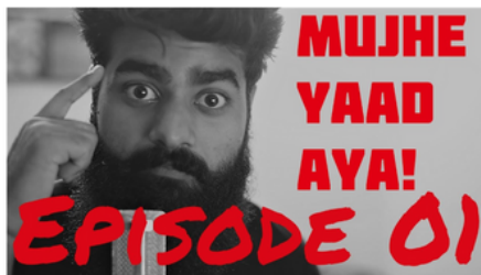
Episode 01 | HAFTA VASOOL Mujhe Yaad Aya | June 18-24