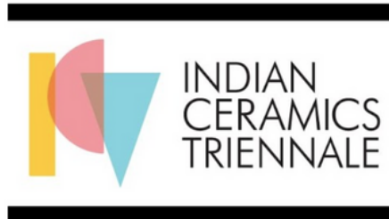
Indian Ceramics Triennale Film 2018