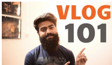
VLOG | 101 | What is a Vlog?