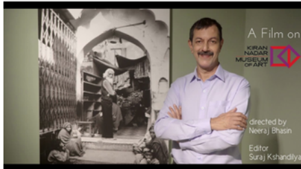
Film: Kiran Nadar Museum of Art | Rajat Kapoor | Delhi